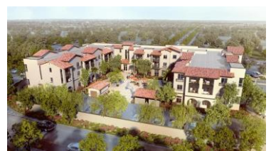
Santa Ana Veterans Village - 2020 Two works of permanent art