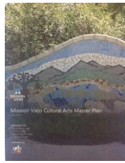
Mission Viejo, 2017