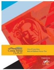
Costa Mesa 2019