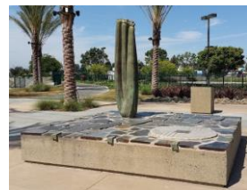
"We Too Were Once Strangers" City of Santa Ana – 2015