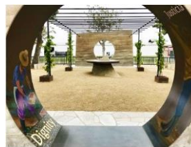
"Table of Dignity" - 2017 OC Fair & Event Center