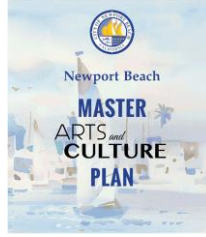
Newport Beach, 2013