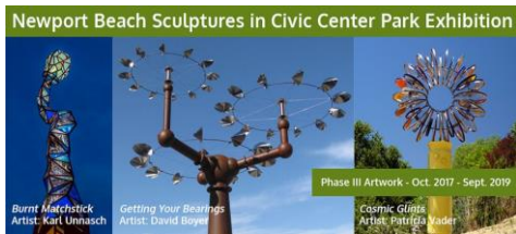
40 sculptures since 2014 – Phase V Opens June 2020 City of Newport Beach