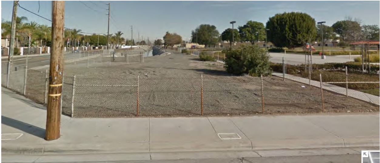
Street view from Sunflower Ave.