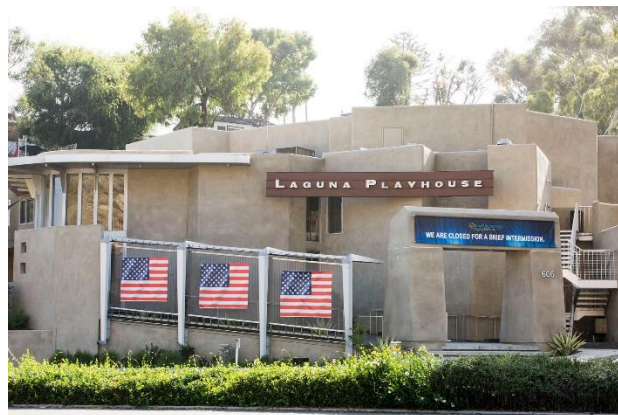
The Laguna Playhouse