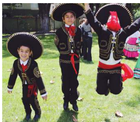
Left: Día del Niño, Arts Orange County.

“I am so appreciative of Arts Orange County which played a big role in securing relief funds during the COVID-19 for our arts community. The dedication and endless effort truly touches me. They are the champion!”