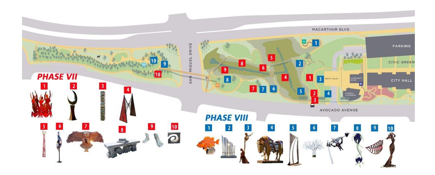
Exhibit A (Peter Walker and Partners Art Master Plan map)

installation, inspection and acceptance by the City; and the second half of the payment after de-installation at the conclusion of the two-year exhibition period.