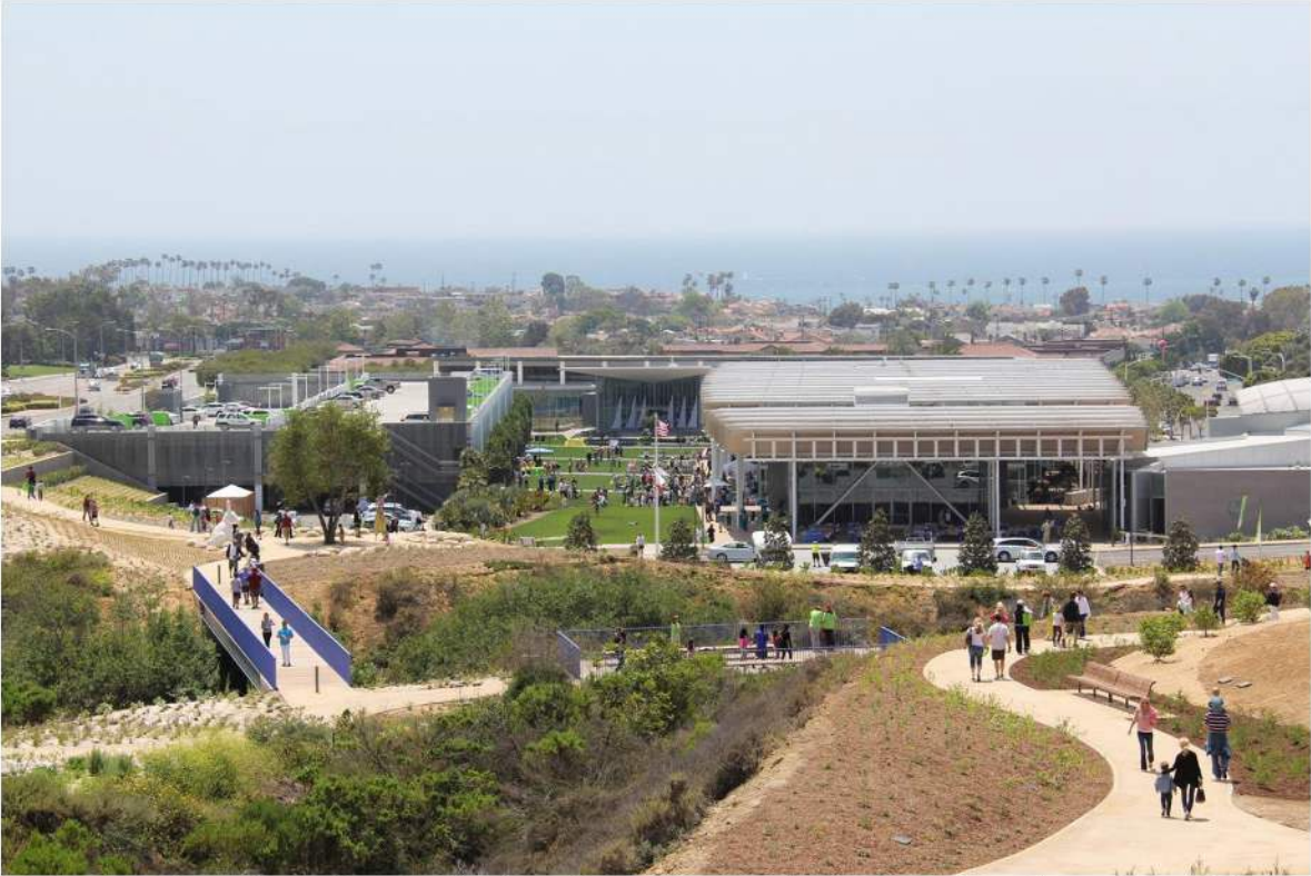
Looking west from the pedestrian bridge which connects the north and south portions of the park.